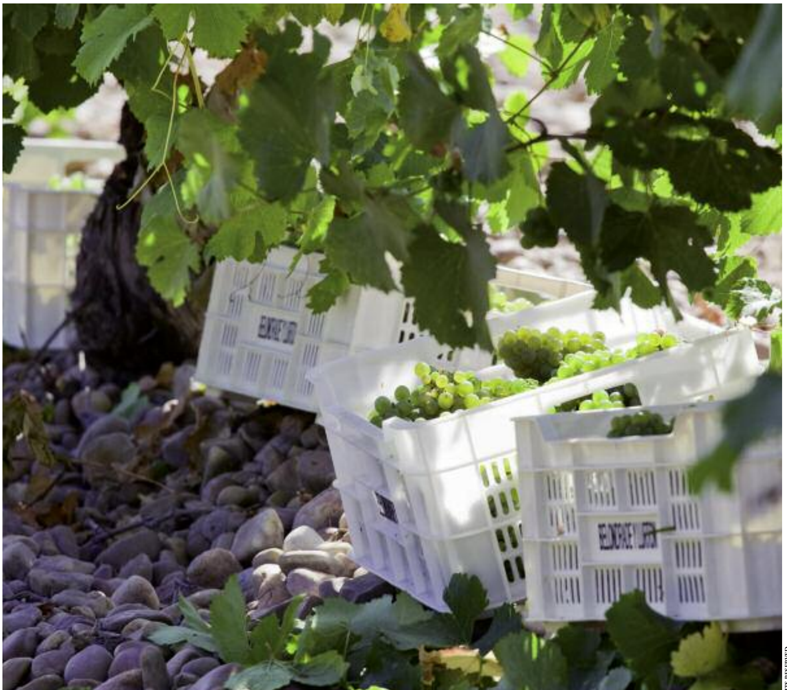
NOW THE SPANISH WHITE WINE OFFERING IS HUGE, VARIED AND ATTRACTIVE